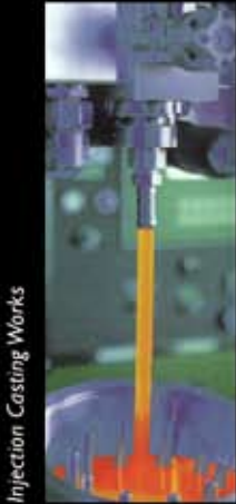
Injection Casting Works